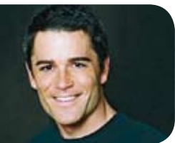
Meet our special guest Yannick Bisson, star of CityTV's The Murdoch Mysteries.